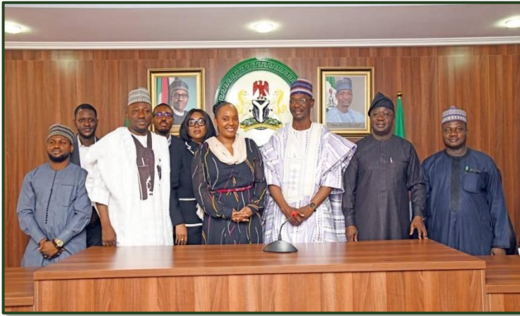
Nasarawa State Government and the CHAI Team