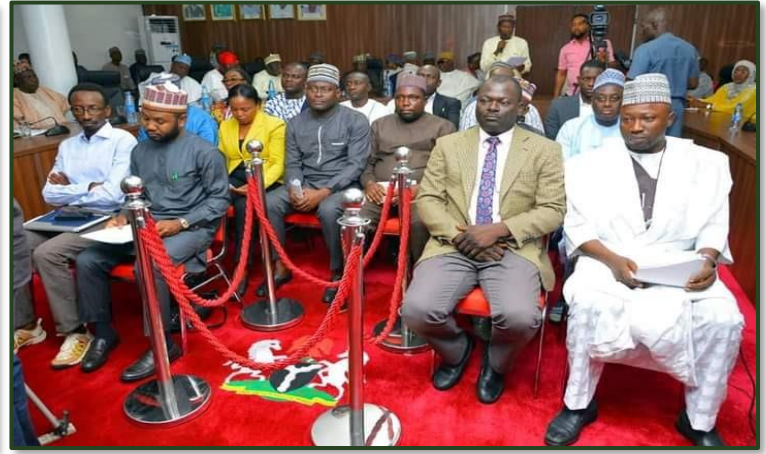
TWG Members at the Inauguration in Government House