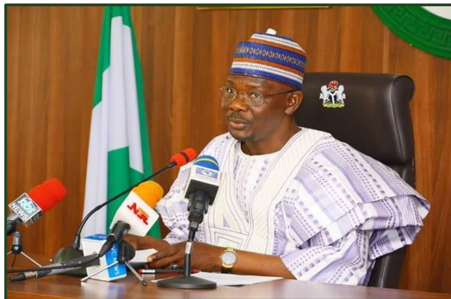
Pronouncement of HCV Elimination by His Excellency

On February 20, 2020, the Governor, pronounced a 5-year (2020 – 2024) HCV Elimination plan with a goal to treat ~124k persons. This is in line with the goals of the Nasarawa Economic Empowerment Development Strategy (NEEDS) to improve