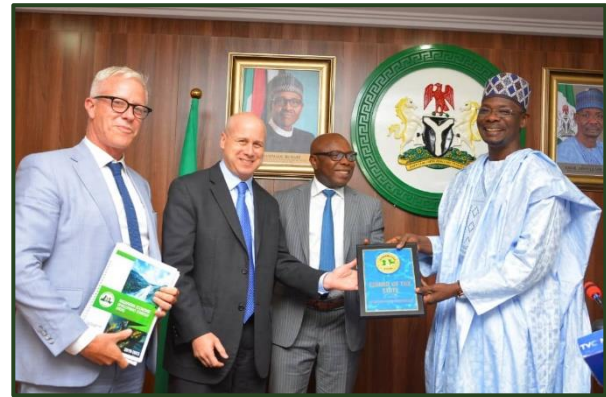
CHAI leadership visit to the Executive Governor