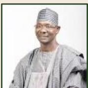
Engr. Abdullahi Sule The Executive Governor

human capital development. A Viral Hepatitis Technical Working Group (VHTWG), Chaired by the Honourable Commissioner for Health, was inaugurated to develop and drive the HCV Elimination implementation strategy with the Deputy Governor providing State-level leadership.